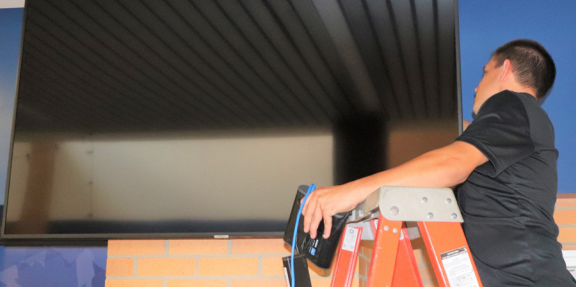
State of the Art Video Walls Installed