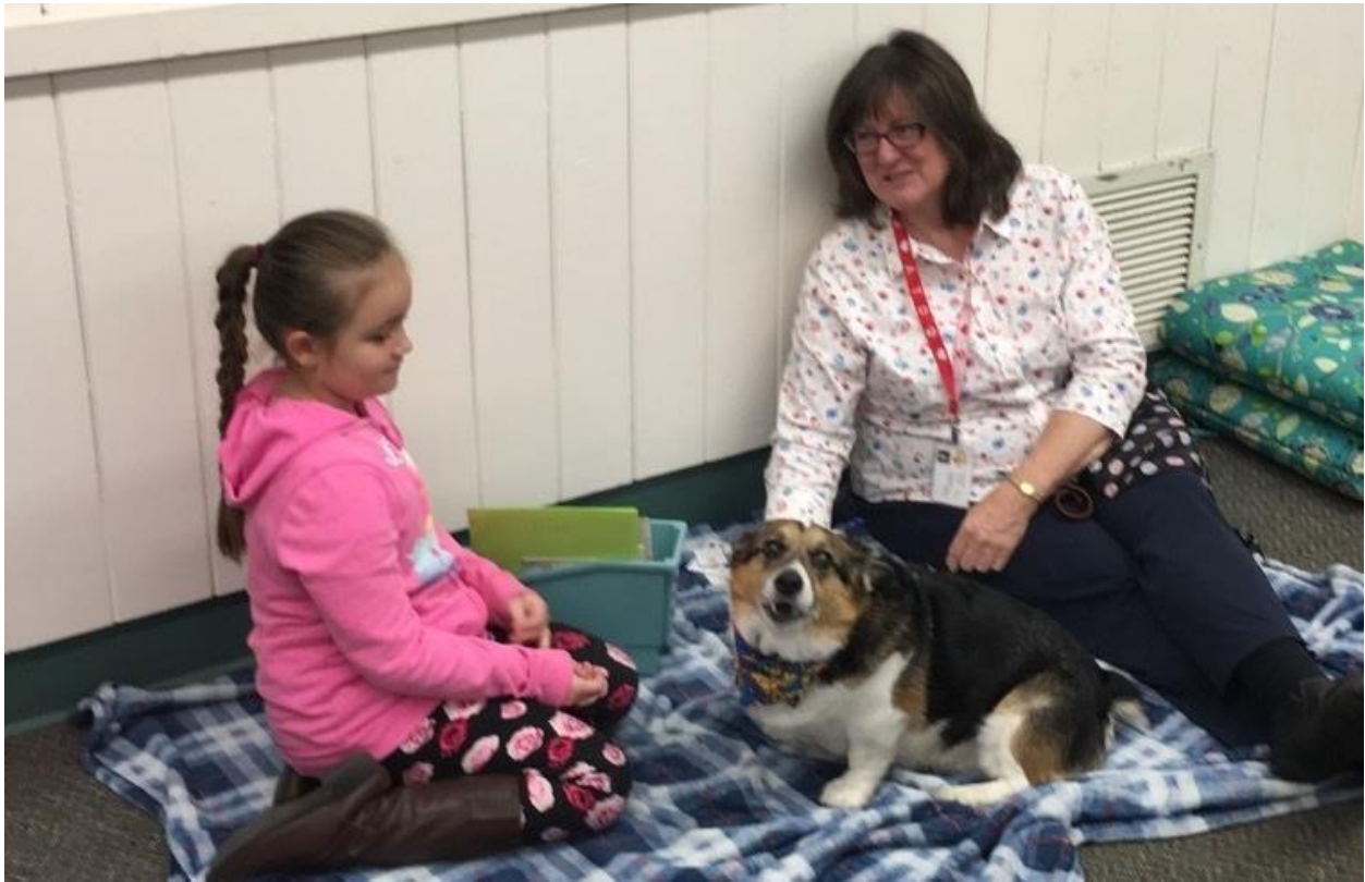
Michener students gets to read to Hacki, a therapy dog every Tuesday and Wednesday Morning

Today being March First, we are kicking off March is Reading Month across the district and across the nation. As always, we encourage every month to be a reading month. In addition to the many resources that our teachers provide using researched based practices to teach literacy, I would encourage parents to visit the Adrian District Library or the Lenawee District Library as a resource for countless numbers of books to help engage children ignite the passion for reading. While March is Reading Month often focuses on adults coming in and reading to students, I would strongly encourage having your child read to you or other family members or even a pet to build their literacy and fluency skills.