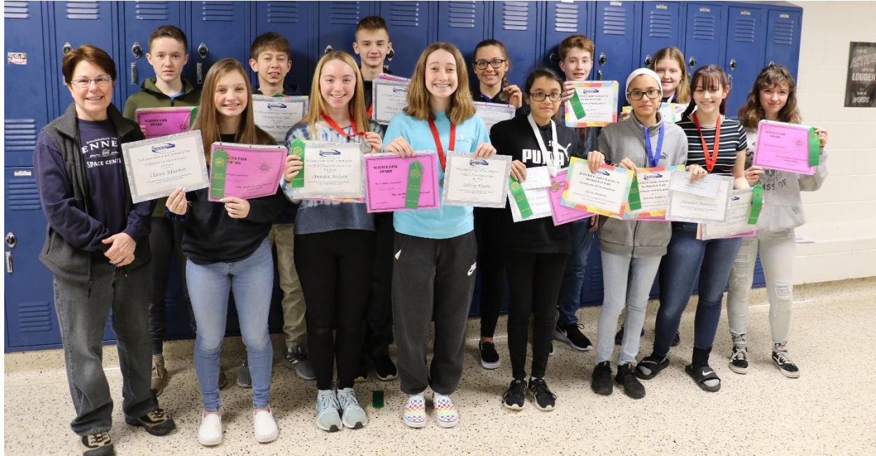
Springbrook Sciene Fair Winners

Congratulations to the students from the Springbrook Advance 8 th Grade Science class. Students participated in the Tri-County Science Fair last month. I am proud to announce that this year's group is the most "winningest" team in school history. Congratulations to all the students that participated and applied their passion for science and STEM learning. Science learning starts early at APS. Alexander Elementary will be hosting their STEAM Night on Monday March 4 th from 5:30 – 7:00.