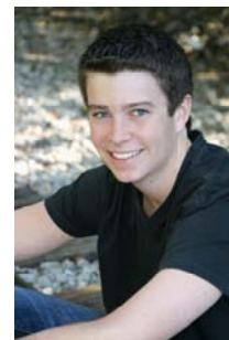
Photo size: 1.5 inches wide x 2 inches tall. Or a standard wallet size. Size of head in the picture should be approximately 1 inch. Non-traditional poses and outdoor shots will be accepted. No full body poses (headshots only), and no props.

DUE DECEMBER 20 th (before winter break)